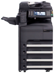
Shown with optional RADF, 500 x 2 Tray, and Internal Finisher 34.4" W x 25.5" D x 45.75 H